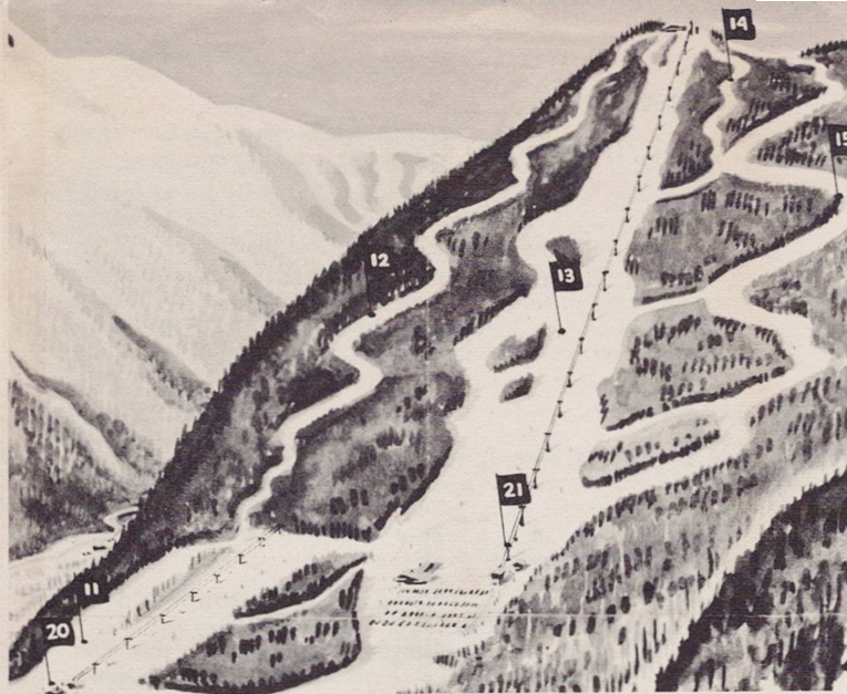
DETAIL MAP OF SPRUCE PEAK—Mt. Mansfield, Stowe, Vermont 11—Spruce Peak Slope; 12—Smugglers Trail; 13—Main Street; 14—Whirlaway; 15—Sterling Run; 20—Spruce Peak Alpine; 21—Spruce Peak Double Chair Lift.