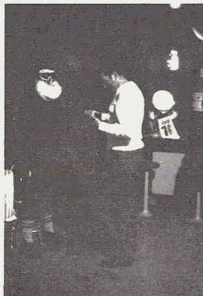
S. Claus and friend

Before and after the visit from St. Nicholas, skiers frolicked in deep powder at Mt. Mansfield on Saturday and at Mad River on Sunday. Conditions were superlative as nature, outdoing itself, had coated everything and branch with ice, then frosted the whole scene with dense powder snow. Even the spruces and pines were white from tip to trunk, and local kids singing Christmas carols